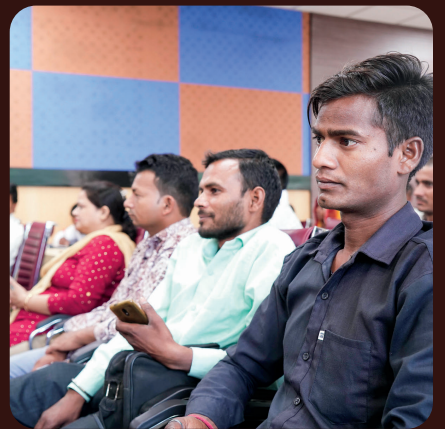
Public Hearing on The Forced Evictions Across India and G20 Events: A Report by Concerned Citizens